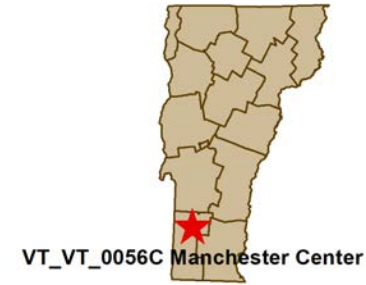
Photo Simulations are for demonstration purposes only. It should not be used in any other fashion or with any other intent. The accuracy of the resulting data is not guaranteed and is not for redistribution

www.VirtualSiteSimulations.com www.ThinkVSSFirst.com