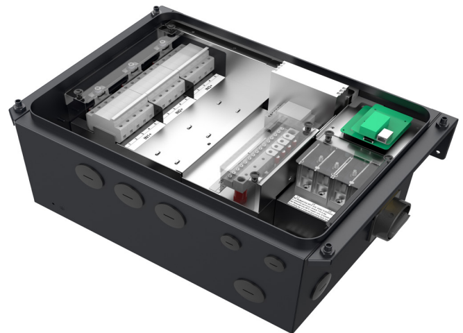
50/60KTL Rapid Shutdown Wire-box