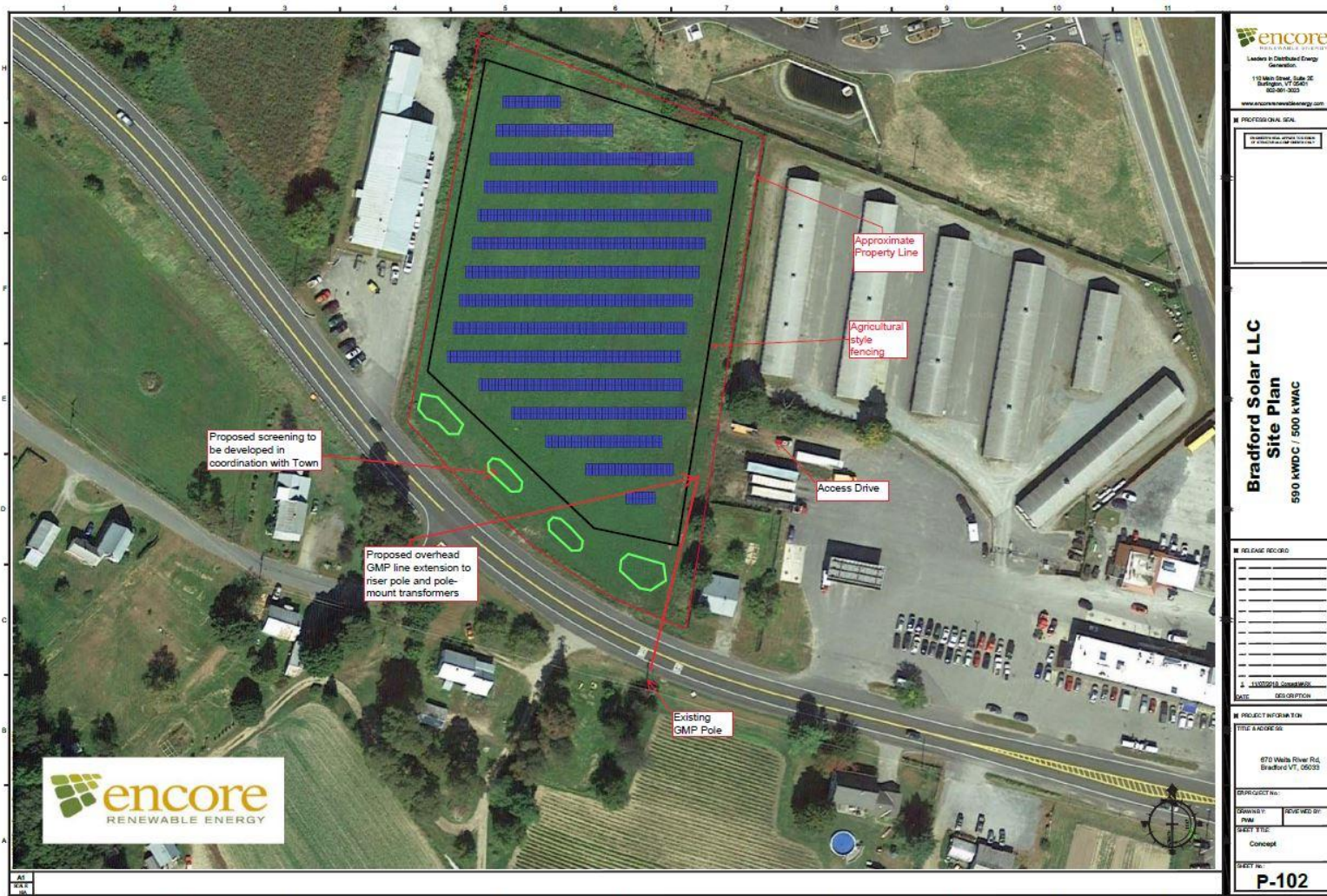
Figure 2. Map showing the location and extent of the proposed Bradford Solar Project, Bradford, Orange County, Vermont.