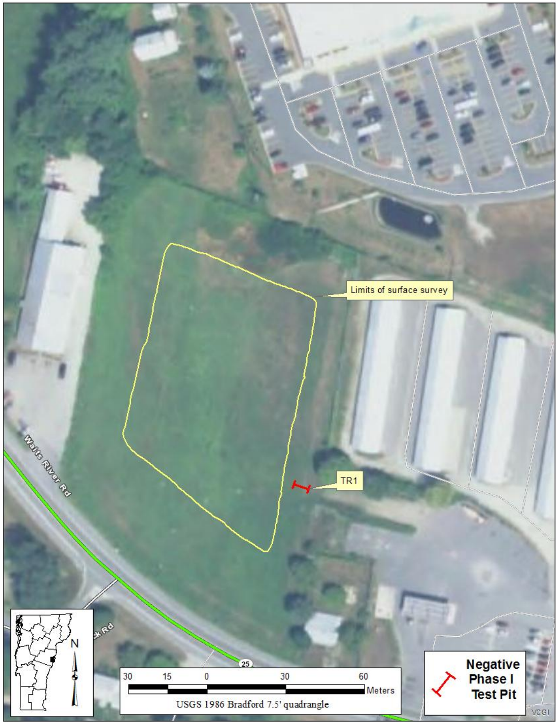
Figure 3. Map showing the limits of the plowing and the Phase I surface survey and excavations for the proposed Bradford Solar Project, Bradford, Orange County, Vermont